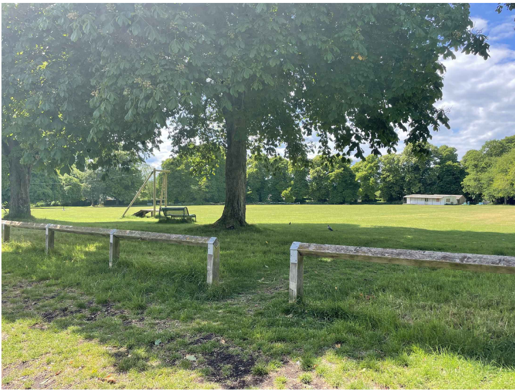
Low Visual Impact Fence Option

Do not scale from this drawing, work to given dimensions. All dimensions to be checked on site. Any discrepancies with this drawing to be reported and clarified prior to commencing work on site, if in doubt - Ask. Corporate Architecture Ltd accept no responsibility for works not undertaken fully in accordance with this drawing and relevant specifications. Copyright © Corporate Architecture Limited